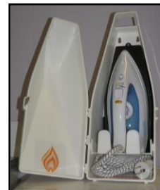
eg. Iron Safe