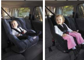
Kursiga lagu xiro gurboodka 8 ilaa 18 Kg