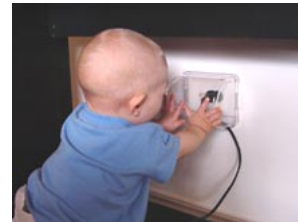
Micky HaHa Powerpoint Cover

Isticmaal dabool iyo dab daboolayaal si looga xafido ilmahaaga argagaxa korontada. Ha u ogolaan in ilmahaagu ku...something is missing here please check afkiisa xarig.