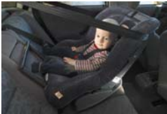
Kursiga ilmaha ee gaariga lagu xiro oo gadaal u jeeda lana bedeli karo