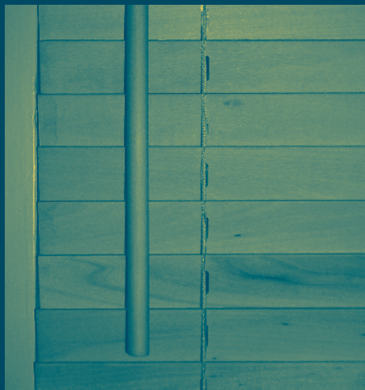
Making your curtains and blinds safe is cheap and easy.

Curtain and blind cords can be a real danger to your children. Children can get caught in the cords and be strangled. This can happen when the cords are too long or they end in a loop, and when furniture or bedding is too close to windows.